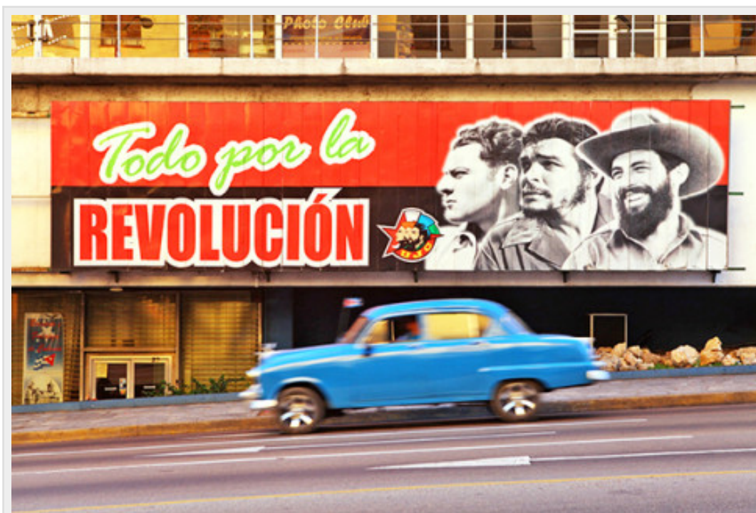
Revolutionary slogans on the streets

I recently hailed a colectivo (shared taxi)—every visitor should do so—and jammed in with six Cubans as the circa-1948 Cadillac cruised down Avenida Linea to the rhythm of a rumba on the